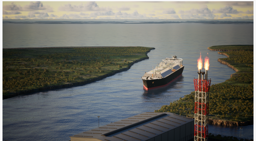
Argent GTT Ships Entering Port Fourchon