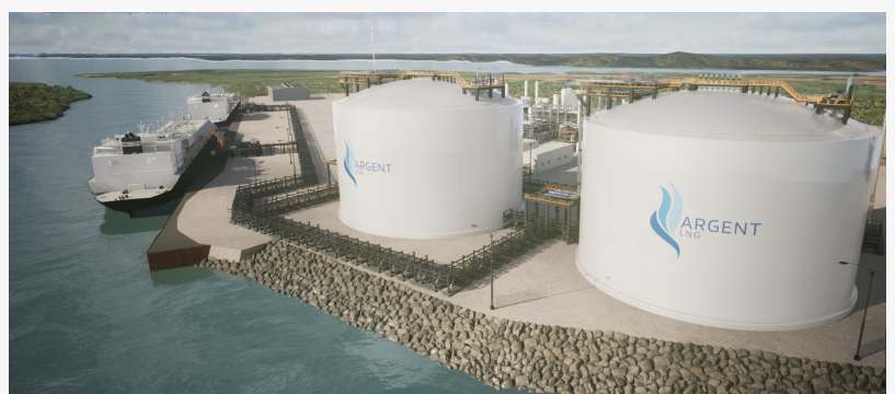
GTT Cryogenic Membrane LNG Containment Tanks