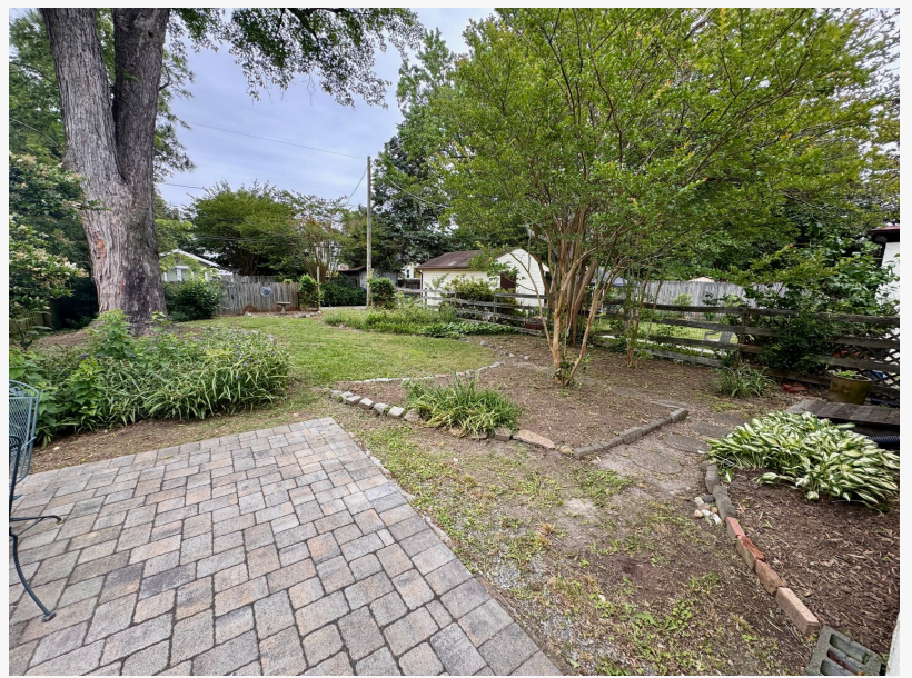
1222 Greycourt Ave., Richmond, VA 23227