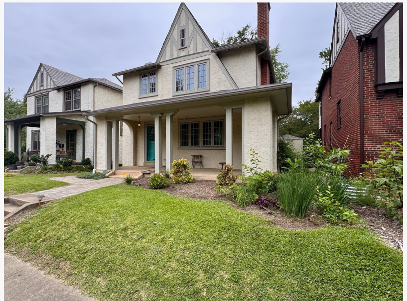
1222 Greycourt Ave., Richmond, VA 23227