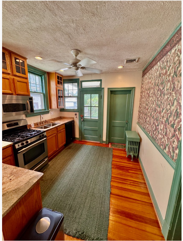
1222 Greycourt Ave., Richmond, VA 23227