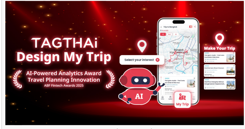
TAGTHAi Wins ABF Fintech Awards 2025