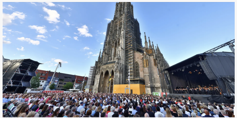
Vienna Symphony Orchestra live premieres Composer Frank Wildhorn's Odessa Symphonie in Ulm Munsterplatz