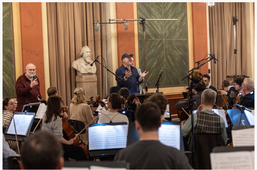
Composer Frank Wildhorn with the Vienna Symphony Orchestra recording The Odessa Symphonie

Comprising seven evocative movements, "The Odessa Symphonie" offers an impressionistic musical view of time, place, struggle, and the enduring hopes and dreams of both invented and real characters striving for peace and a better life. The Movements: A Day in the Life of Odessa; A Call to Arms/Battle Royale; Farewell to a Soldier; Dreaming of Peace; A Lonely Star, The Journey Home; Homecoming and Remembrance make up the heartfelt musical journey.