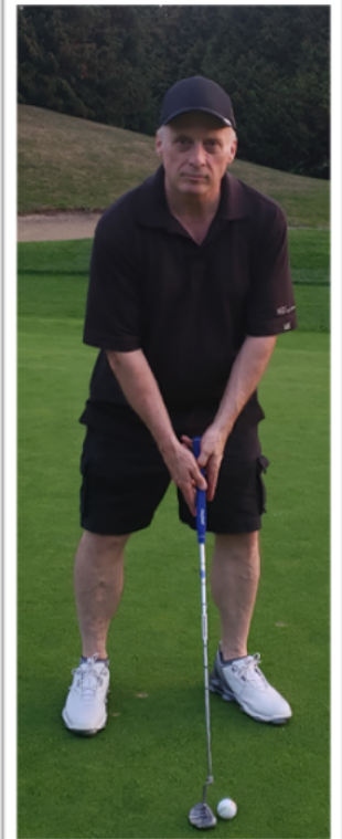
Author: Norman JN Lobb

Themes of AI ethics, digital consciousness, and post-collapse survival