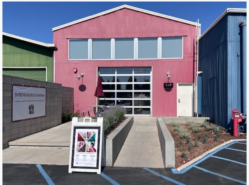
Leatherby Center for Entrepreneurship and Business Ethics Exterior