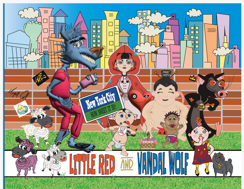
Little Red and Vandal Wolf Book Cover