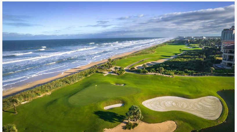
Ocean Course at Hammock Beach Golf Resort & Spa.

Signature Designed Ocean Course at Hammock Beach Golf Resort & Spa in Palm Coast, Florida beginning in 2026 under a new multi-year agreement. This year's Constellation FURYK & FRIENDS presented by CircleK returns to Timuquana Country Club for the final year Sept. 29 – Oct. 5, 2025, in Jacksonville, Florida.