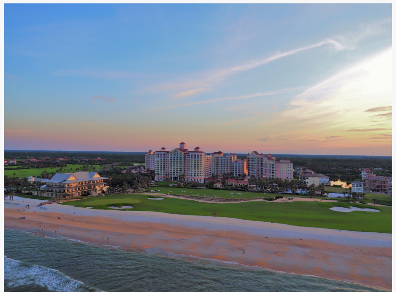
Hammock Beach Golf Resort & Spa