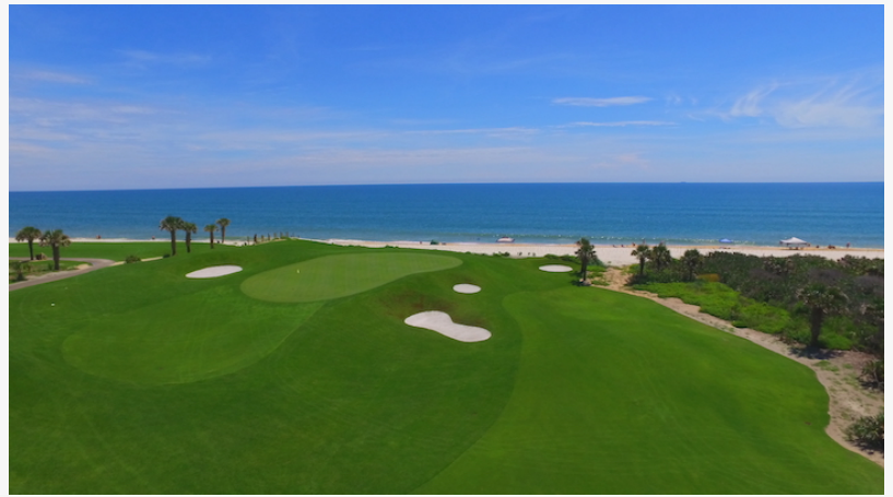
The breathtaking Eighth Hole of the Ocean Course at Hammock Beach Golf Resort & Spa.

Continuing Our Charitable Mission The Jim & Tabitha Furyk Foundation will