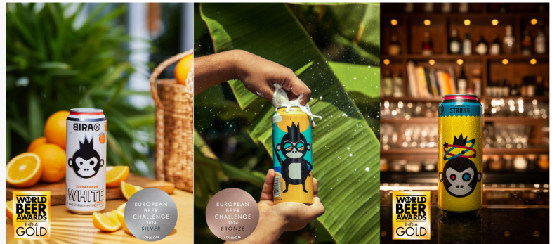
Bira 91's award-winning portfolio of beers available in Bengaluru

Bira 91 Boom: A rich, malty Munich Helles-style lager designed for nights that are just getting