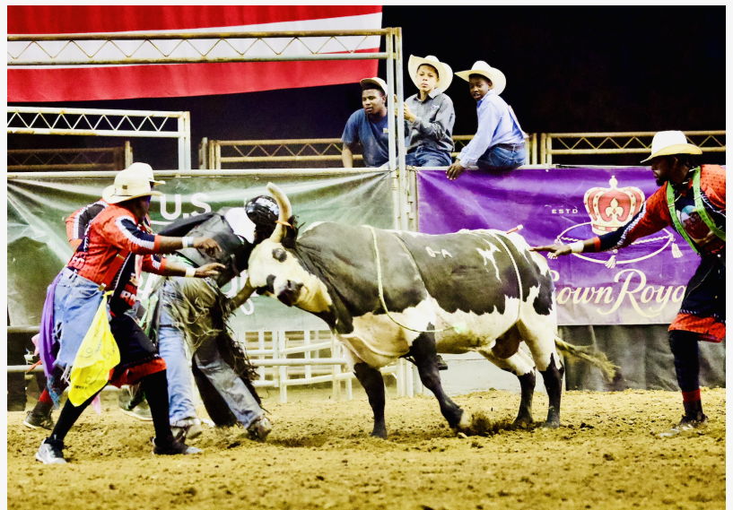
BPIR LA Bull Rider