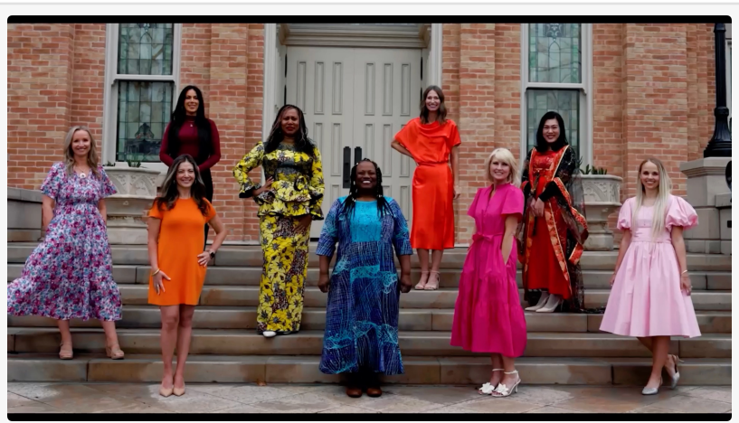
The women of Women in Christ