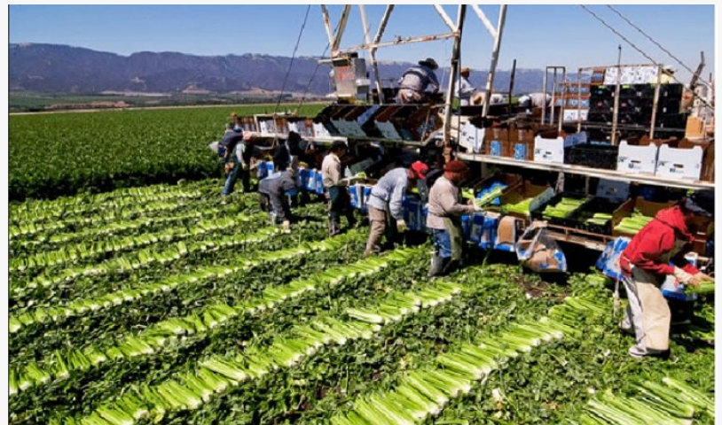
Farm Workers Harvesting

Grow Your Own Business With Powerful Information