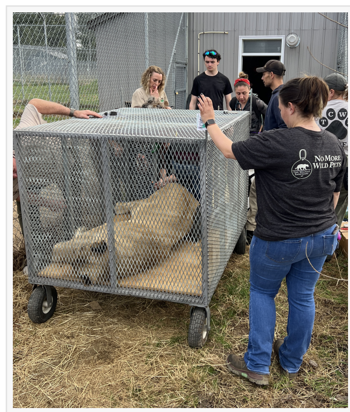
The Wildcat Sanctuary assists with transfer of lions to temporary facility

These lions—victims of neglect, inbreeding, and repeated facility closures—are now headed to lifelong sanctuary at globally accredited sanctuaries committed to ethical, individualized care.