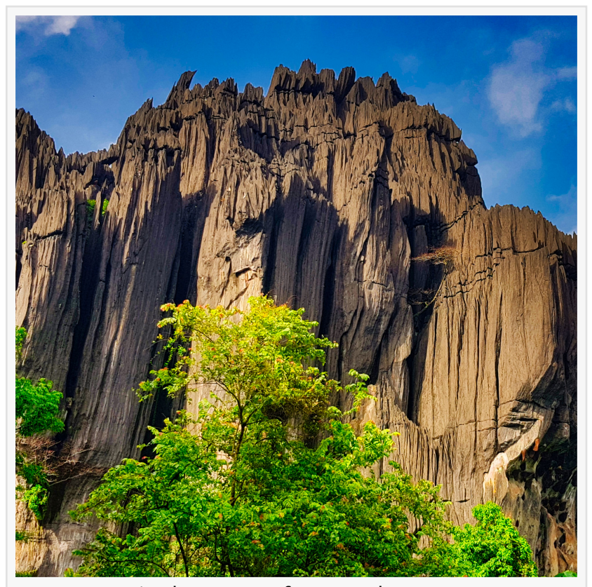
Yana Caves in the Heart of Karnataka

Wildlife tourism will take center stage with captivating displays of Bandipur and Nagarhole National Parks, known for their thriving tiger populations. The