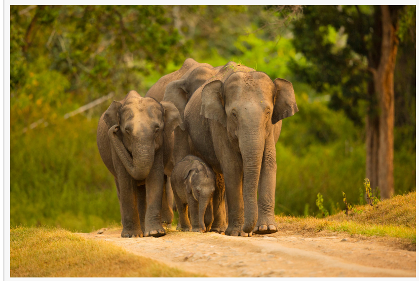
Elephant family in the Bandipur National Park, Karnataka