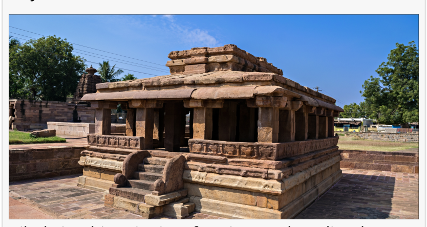
Aihole is a historic site of ancient and medieval era Department of Tourism, Government of Karndchist, Hindu and Jain monuments.