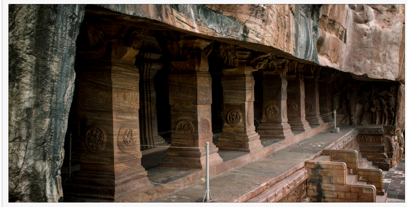
Badami Caves, A masterpiece of ancient Indian craftsmanship.

pavilion will further highlight Karnataka's emerging tourism segments, including wellness