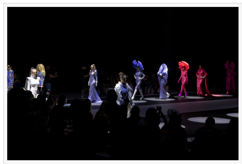
Fashion Factor 9 Dubai____

This press release can be viewed online at: https://www.einpresswire.com/article/833223630