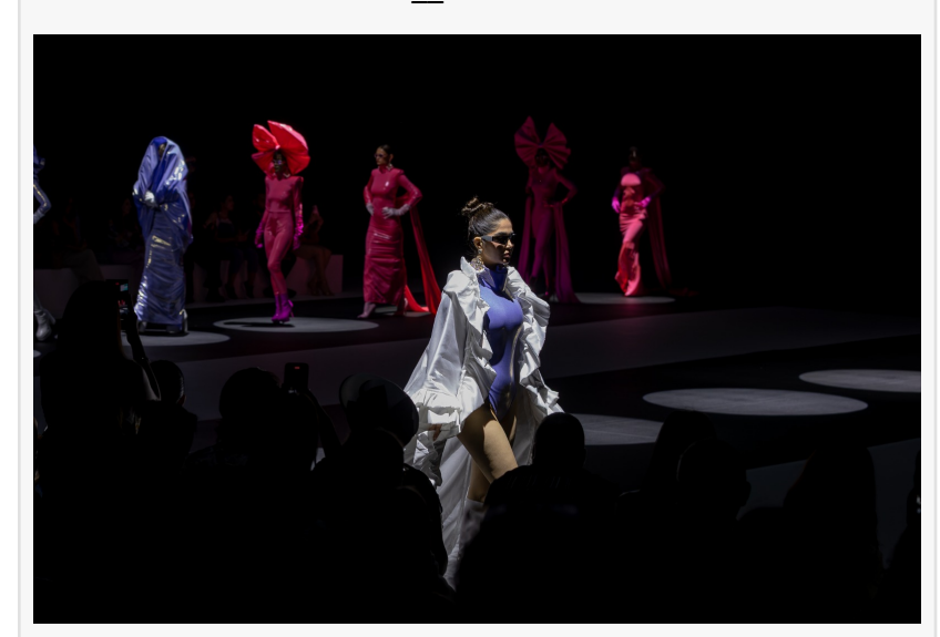
Fashion Factor 9 Dubai_