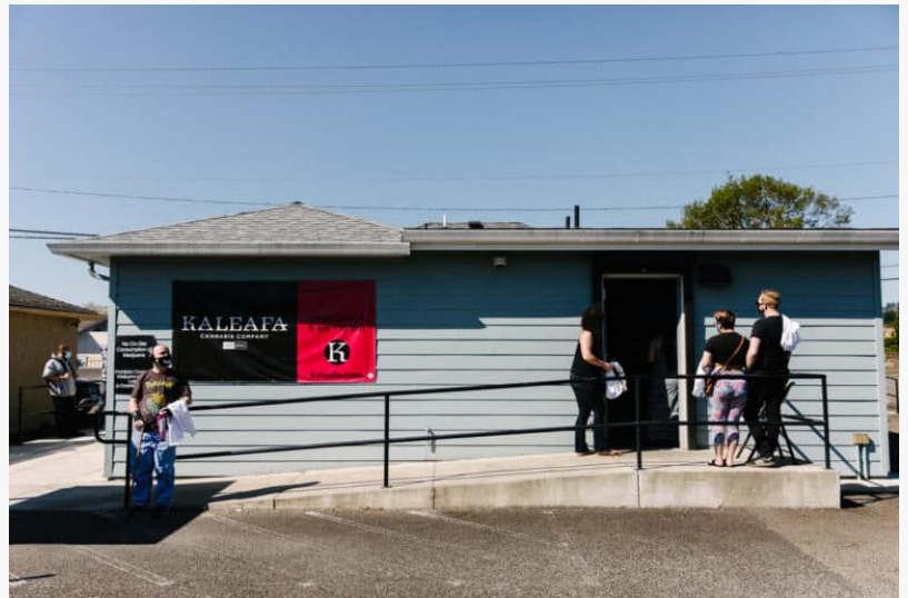
kaleafa beaverton weed dispensary