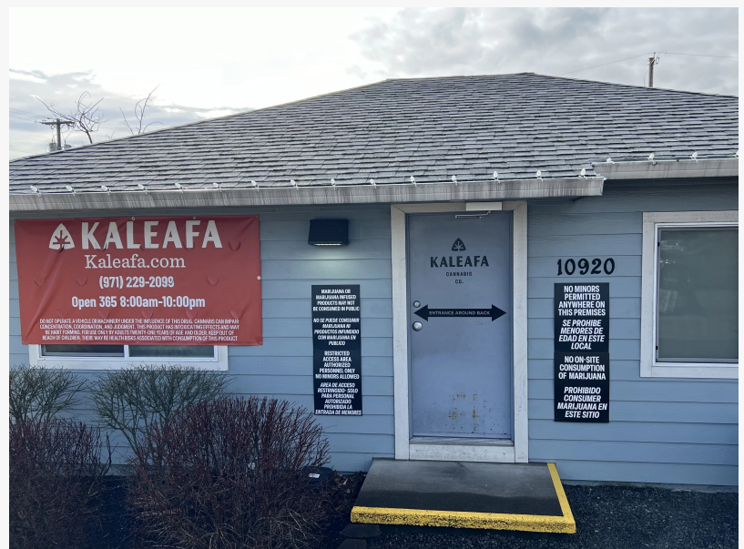
kaleafa beaverton location