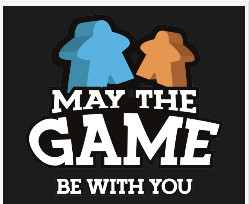
May The Game

The final version of the May The Game backpack holds a 4.9/5 average rating on Amazon, with reviewers calling it “perfect for game nights,” “ideal for conventions,” and “shockingly comfortable even when fully loaded.” As the hobby continues to grow globally, May The Game is already exploring future additions to its product line, including a more compact companion model. The