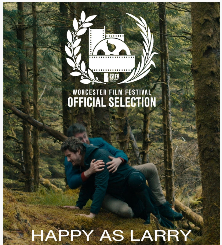
HAPPY AS LARRY THUMBNAIL SHOWING WORCESTER FILM FEST LAURELS