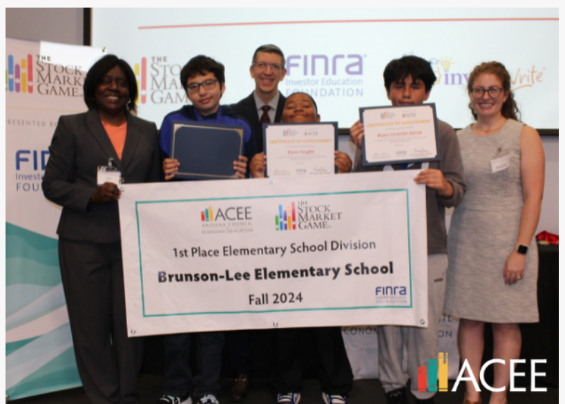
Photo from ACEE's Learning to Save and Invest Awards Ceremony

PHOENIX, AZ, UNITED STATES, July 24, 2025 /EINPresswire.com/ -- For more than two decades, students across Arizona have been building their financial futures through the SIFMA Foundation's Stock Market Game™ , operated exclusively in Arizona by the Arizona Council on Economic Education (ACEE). Using $100,000 in hypothetical funds and real-time market data, students learn to invest in publicly traded companies, gaining essential skills in personal finance, math, research, technology, communication, and entrepreneurship.