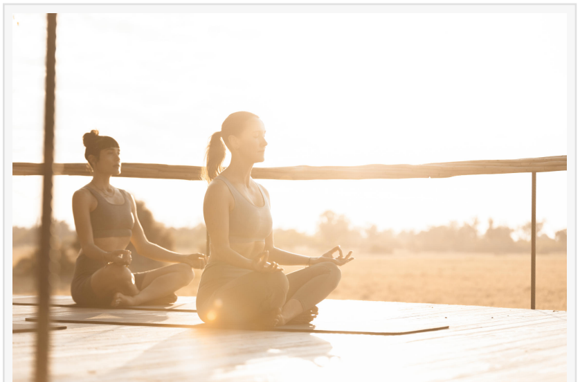
Wilderness Mombo Wellness

Hyena Valley Dam. After an exhilarating morning exploring the conservancy on horseback, foot, or e-bike, guests can indulge in a variety of soothing treatments, including luxurious massages, refreshing facials, and invigorating scrubs, all crafted to leave them feeling completely rejuvenated. The Lodge also introduced a new sundeck, seamlessly connecting the pool to The Wallow. This extended space offers a picturesque spot for lounging, yoga sessions, private candlelit dinners, and game viewing after a restorative spa treatment. This peaceful haven offers the perfect blend of adventure and relaxation, allowing visitors to unwind amidst the serene beauty of nature. This tranquil haven, which debuted in November 2024, allows guests to unwind after an active day on safari with eco-friendly indulgence.