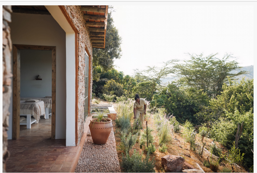
Borana Lodge, Kenya

Spier Hotel | Winelands, South Africa: Reopened in March 2025 following a year-long transformation, Spier Hotel in South Africa's picturesque Winelands now offers a more private, wellness-focused retreat. The redesigned property features 80 rooms, including 12 suites, and introduces a state-of-the-art wellness center with 10 treatment rooms, yoga and Pilates spaces, an adults-only pool,