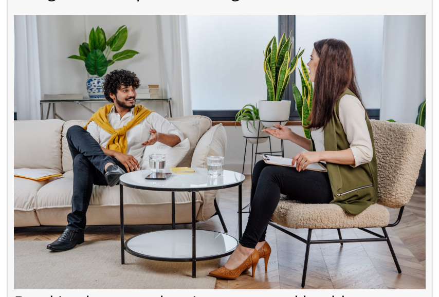
Breaking language barriers to mental health care. Equilibrium Mental Health Services offers fully bilingual therapy sessions, ensuring every client can express themselves comfortably in their preferred language while receiving culturally competent treatme