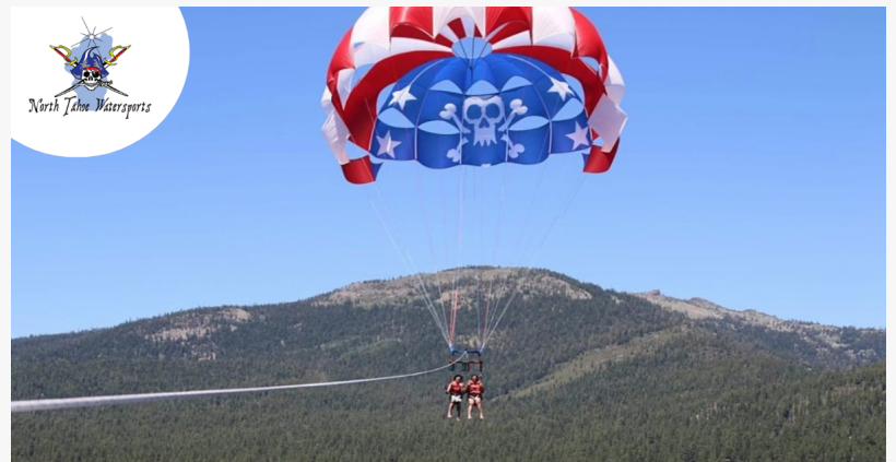
parasailing in north lake tahoe