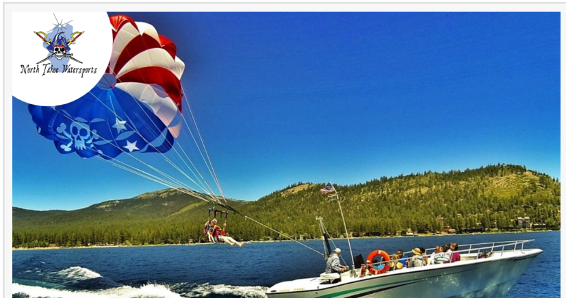
parasailing in tahoe city california

North Tahoe Watersports provides parasailing in Lake Tahoe, CA , with a focus on safety, professionalism, and accessibility. The company's certified captains are U.S. Coast Guard licensed and have extensive experience, having conducted over 100,000 flights combined over Lake Tahoe's waters. Parasailing flights are available for singles, tandems, or triples, accommodating a wide range of ages and comfort levels. Participants as young as five and as old as eighty-five