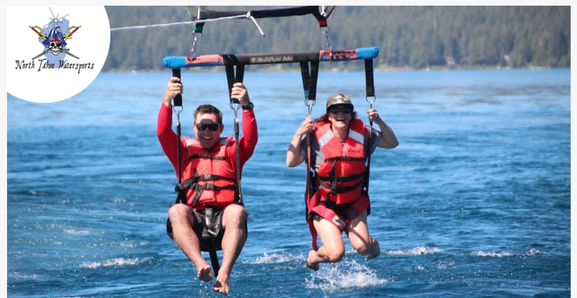
parasailing in north lake tahoe california