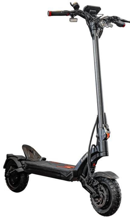
Mantis X Plus

At the core of the Mantis X Plus is a dual 500W motor configuration, providing a combined 1000W of output, enabling top speeds of 31 mph and hill-climbing capabilities up to 25 degrees. This specification places the model well above typical commuter scooters in its class, reinforcing Kaabo's