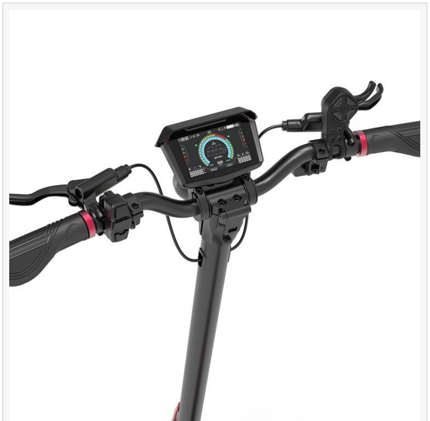
Mantis X Plus Front

Comprehensive lighting, including a high-lumen LED headlight, deck illumination, and turn indicators, ensures high visibility in urban environments. This is an increasingly critical feature for both rider safety and regulatory compliance in large metro markets.