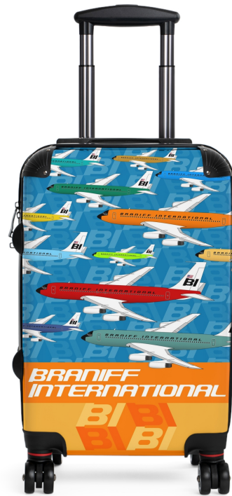
New Luggage featuring Braniff Boeing 707 Jet

Braniff Airways, Incorporated, d/b/a Braniff International, the former international airline, is now a leading global historic airline branding and marketing, online retail, historic airliner tour firm and hotelier, which was originally formed in 1928. Braniff manages a portfolio of licensing agreements worldwide. The company operates its lucrative Braniff Boutique Online Retail store at www.braniffboutique.com that sells to 120 plus countries worldwide along with three brick and mortar stores.