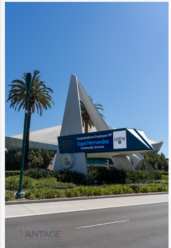
Anaheim Convention Center - New 8mm Vantage LED Display