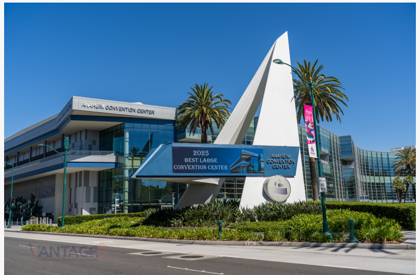
Anaheim Convention Center - 8mm Vantage LED Display

ANAHEIM, CA, UNITED STATES, July 25, 2025 /EINPresswire.com/ -- The Anaheim Convention Center, one of the nation's premier event destinations located directly across from Disneyland, has completed a cutting-edge LED display installation in Anaheim . The upgrade replaces an outdated Daktronics board with a high-performance 8mm pixel pitch LED display , delivering a bold new visual experience for millions of guests who pass through the venue each year. The installation was facilitated and completed by Padcor Electric.