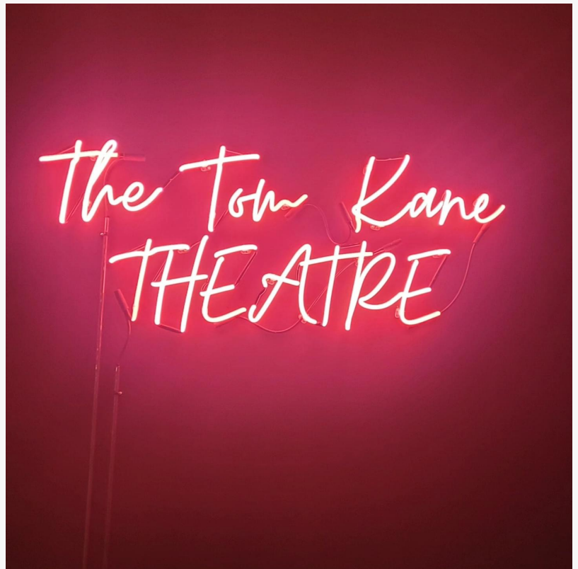
The Tom Kane theatre sign