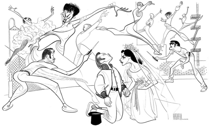
West Side Story (1957) (Image credit: Al Hirschfeld Foundation)