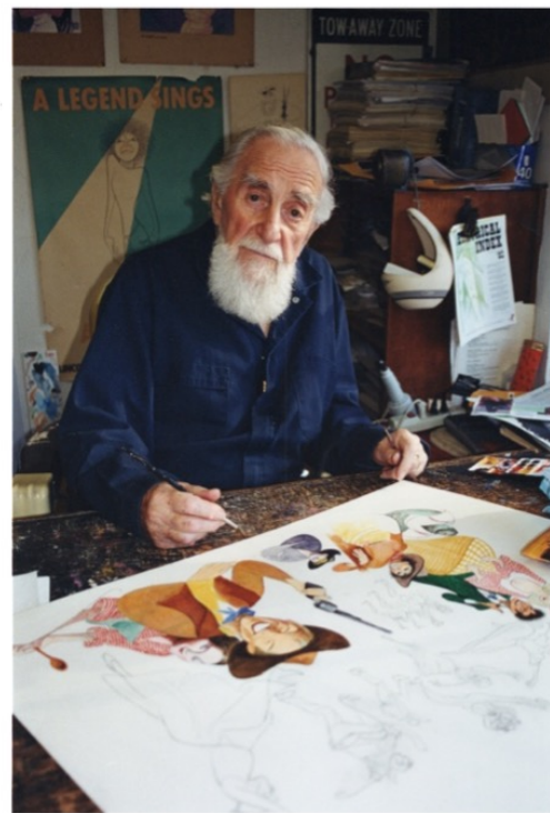
Al Hirschfeld