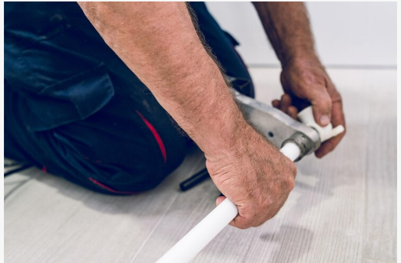
home repiping near me