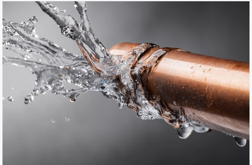
home water leak repair