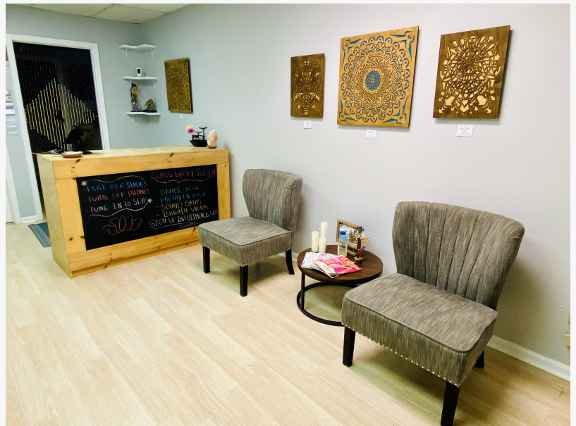
Intuit Minds Center