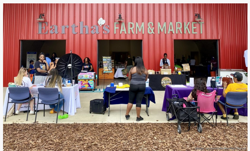
Eartha's Farm & Market