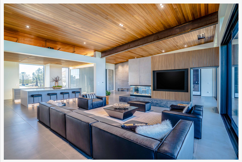
6,300 square feet main residence designed by Mussa Architects