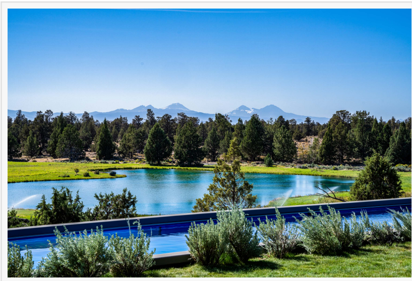
Bordered by Bureau of Land Management land on two sides

Designed by Mussa & Associates and built by local craftsmen, the home includes radiant floor heating, expansive windows with mountain views, touchless pocket doors in the primary suite, and a 40 kW Tesla solar system with battery backup. All structures feature fireproof cement or metal siding. Metal roofs offer durability and easy maintenance. Though connected to the grid, the estate can run fully off-grid.