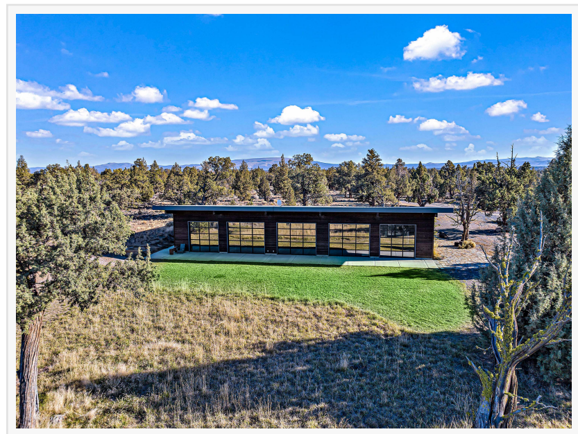
Mountain retreat providing the ultimate place to unwind and relax, only 10 minutes from the city

Concierge Auctions is the world's largest luxury real estate auction marketplace, with a state-of-the-art digital marketing, property preview, and bidding platform. The firm matches sellers of one-of-a-kind homes with some of the most capable property connoisseurs on the planet. Sellers gain unmatched reach, speed, and certainty. Buyers receive curated opportunities. Agents earn their commission in 30 days. Acquired by Sotheby's, the world's premier destination for fine art and luxury goods, and Anywhere Real Estate, Inc. (NYSE: HOUS), the largest full-service residential real estate services company in the United States,