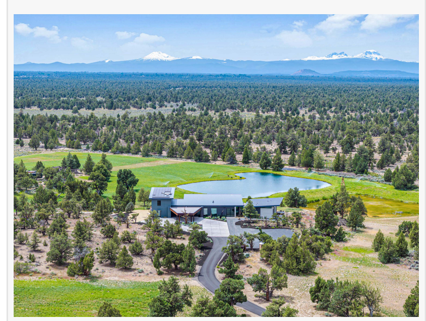
Intentional site planning, cutting-edge technology, and the best in home automation

As part of Concierge Auctions' Key for Key® giving program in partnership with Giveback Homes, the closing will result in funding towards new homes built for families in need.