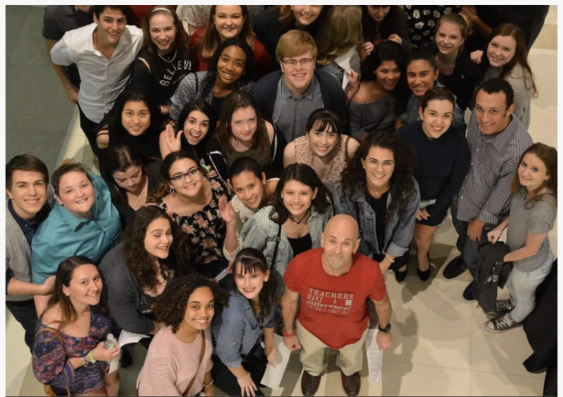
Seeger meets a group of students after a performance

This press release can be viewed online at: https://www.einpresswire.com/article/834298496