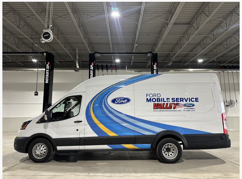
Valley Ford Pro Elite Mobile Service Van