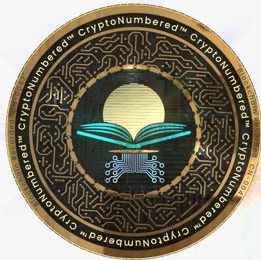
CryptoNumbered™ Edition Token Etched on Ethereum.