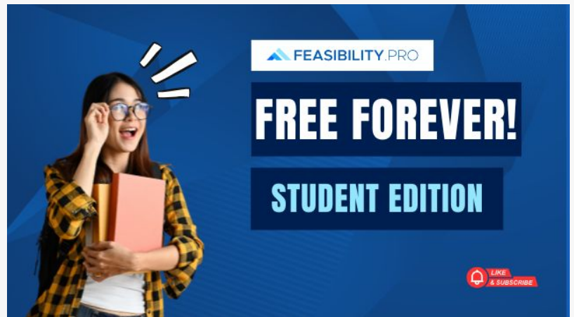
Free Feasibilitypro software

Key Features of Feasibility.Pro Student Edition