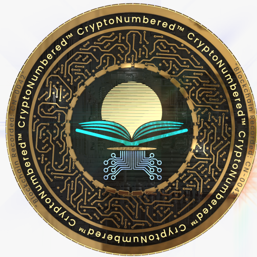
CryptoNumbered™ Token for Early Book Backers

Arrow Dot Press publishes bold cultural works through Content Backing™ where supporters help bring books to life and receive numbered, collectible editions secured on the blockchain. It’s