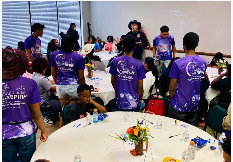
BPIR Foundation, Anti-Violence Ventures (AVV) youth empowerment workshop