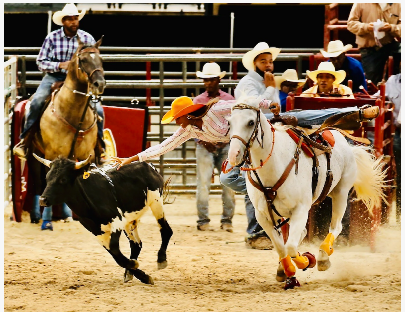
BPIR Ladies Steer Undecorating

ATLANTA, GA, UNITED STATES, July 28, 2025 /EINPresswire.com/ -- The 41st Annual Bill Pickett Invitational Rodeo (BPIR), the nation's only African American touring rodeo association, is headed back to the South for an unforgettable Soul Country Rodeo Weekend , August 1–3, 2025. As the final stop on the BPIR Legacy Rodeo Tour, Atlanta brings the energy and pride of Black cowboy culture to the spotlight in a celebration of music, community, and rodeo tradition.