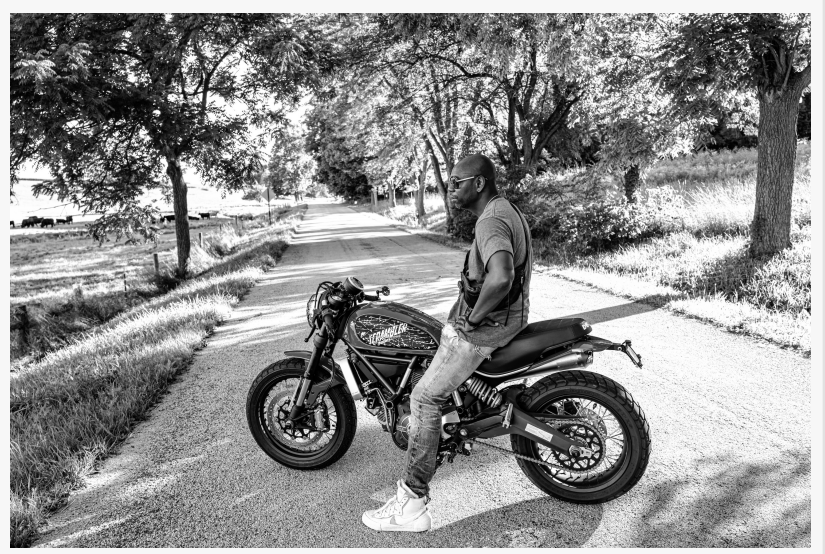
Dave Chappelle in Yellow Springs, Ohio, 2020

series that began in summer 2020 in Yellow Springs, Ohio. Fueled by the murder of George Floyd, shut-in by the closures of businesses due to the pandemic, and unable to perform around the country, the independent film, "Dave Chappelle Live In Real Life" follows Chappelle as he