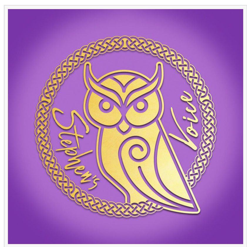
Today is International Prescribed Harm Awareness Day, founded by Stephen's Voice, a UK-based charity that speaks for those silenced by medication-induced suicide.

This press release can be viewed online at: https://www.einpresswire.com/article/834725047