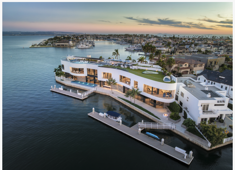
Contemporary Waterfront Masterpiece by Horst Architects & Island Architects