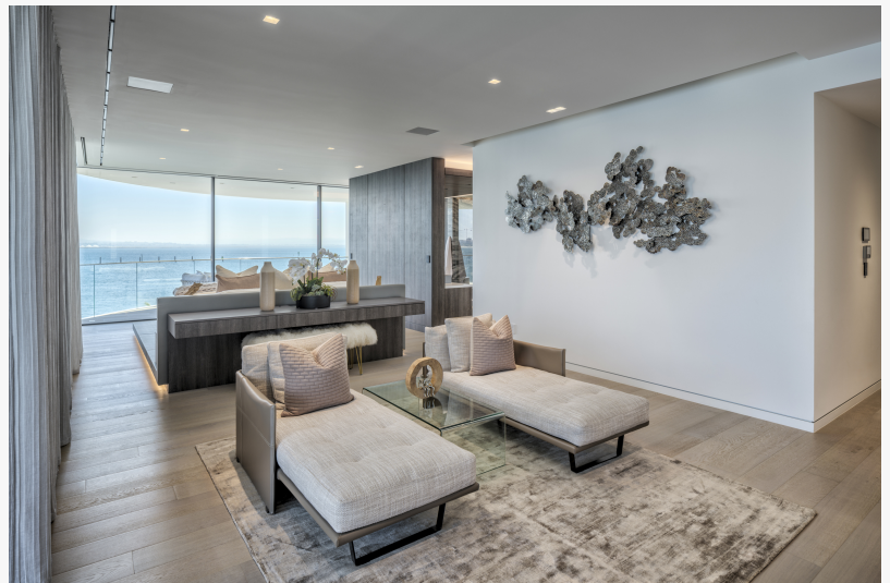
Seven Bedrooms with Private Balconies and Eleven Luxury Bathrooms