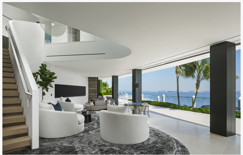
JBL Synthesis Theater & Smart Home with Floor-to-Ceiling Bay Views