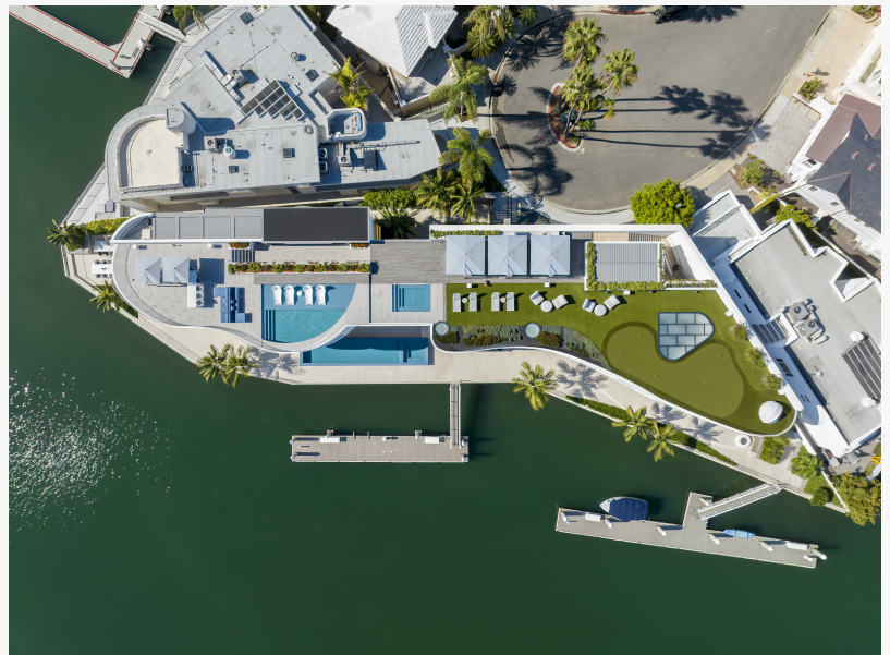
Over 320 Feet of Bayfront with 95-Foot and 60-Foot Yacht Docks