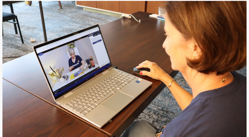
Judy uses GetSetUp to explore virtual health and wellness classes to help her live healthier and happier.

MIDVALE, UT, UNITED STATES, July 29, 2025 /EINPresswire.com/ -- GetSetUp , the largest digital learning platform for older adults, has been honored with the prestigious World Summit on Information Society (WSIS) "AI for Good Award" at the International Telecommunication Union (ITU) AI for Good Global Summit, hosted by the United Nations. As the only U.S. based organization recognized at the global event in this category, GetSetUp was celebrated for its innovative use of artificial intelligence to expand access to critical services and support lifelong learning for older adults and vulnerable communities.