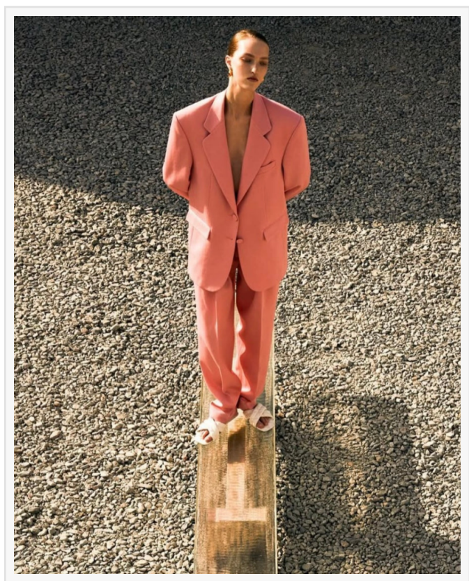
Woman in oversized peach colored suit