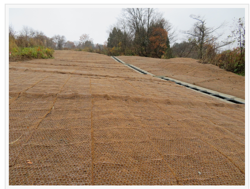
Coir netting used for erosion control solutions

Supports vegetation growth: roots penetrate through the coir mat, creating a living web that marries soil stability with plant resilience. Versatile application: ideal for green roofs, newly seeded lawns, roadside banks, wildflower meadows, tree planting sites, and more.