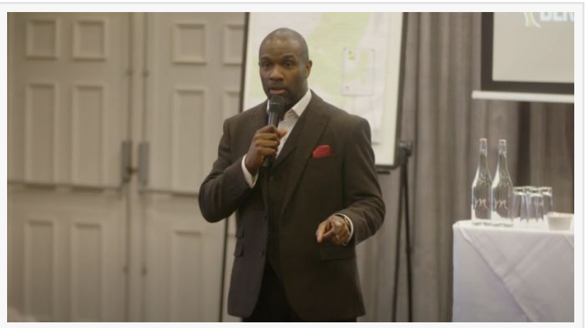
Derek Redmond - Champions Speakers Agency

LONDON, UNITED KINGDOM, July 29, 2025 /EINPresswire.com/ -- <u>Derek</u> <u>Redmond</u>, the Olympic athlete whose 1992 Barcelona Games moment became a global symbol of determination, delivered his 1,000th keynote address in July 2025, marking a significant milestone in corporate speaking. A seasoned speaker,