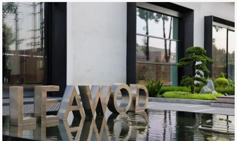
LEAWOD's Core Advantages, Applications, and Customer Focus