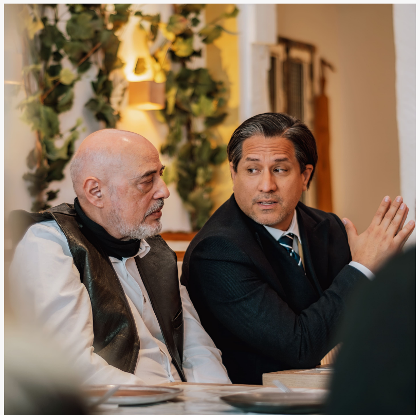
Soriano Motori is an innovative lifestyle company.

Pre-sales engagement, customer acquisition, metaverse intro, gaming