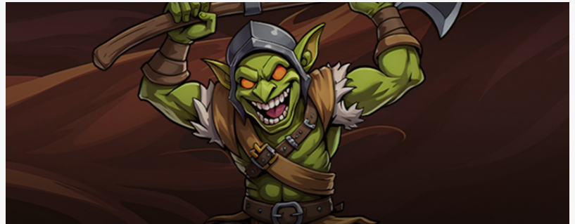
Frontier Header Image

McCoy, COO of Splinterlands. "With Frontier Format, we're cutting through the noise. This isn't