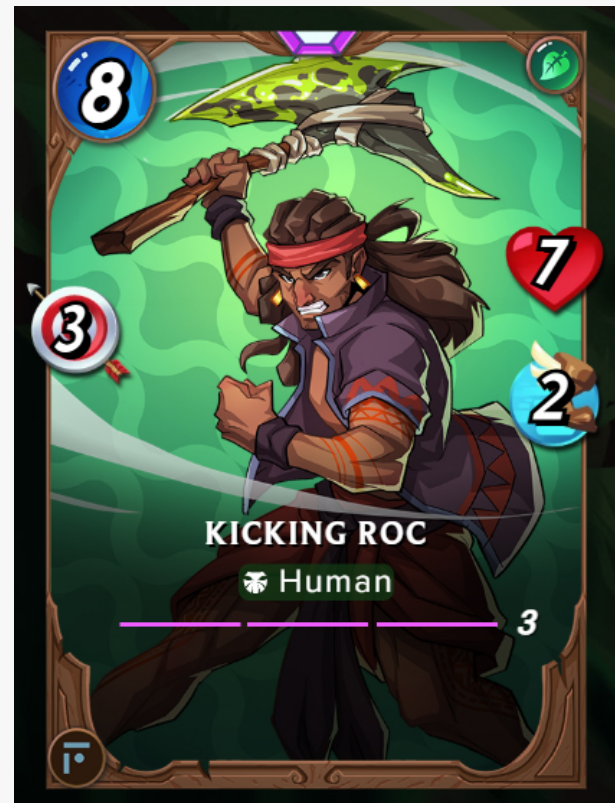
Kicking Roc - Epic card