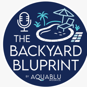
The Backyard BluPrint Logo