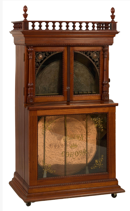
An early 20th century Regina Corona music box with a 27-inch disc automatic changer, in a Honduran mahogany case, 73 inches tall by 39 inches wide, should garner $5,000-$10,000.