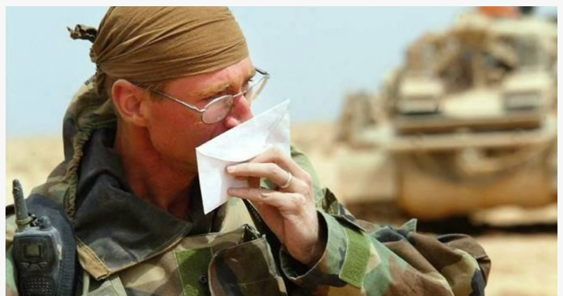
A deployed U.S. service member pauses to kiss a handwritten letter—one of millions sent through A Million Thanks' national letter-writing campaign.

TOPEKA, KS, UNITED STATES, July 29, 2025 /EINPresswire.com/ -- A Million Thanks , a national nonprofit dedicated to supporting U.S. military service members through handwritten letters of appreciation, has officially relocated its national headquarters from California to Topeka, Kansas. The move marks a strategic shift aimed at expanding the organization's national footprint and deepening its community and civic engagement efforts.