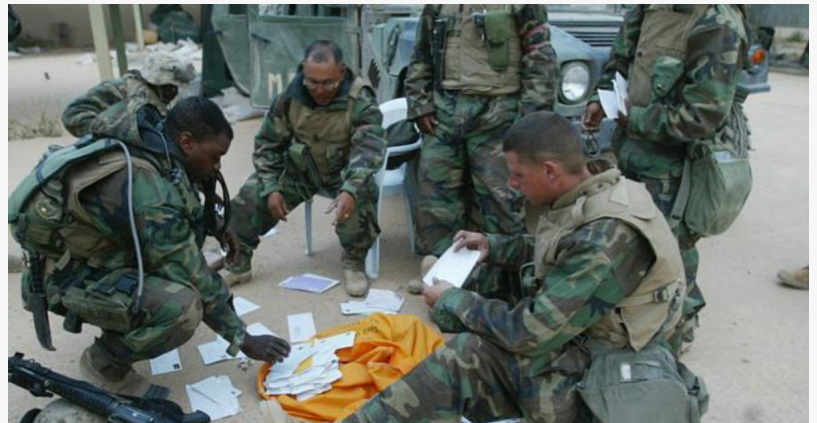
A group of U.S. service members sort and distribute handwritten letters while deployed, a powerful reminder of how personal messages boost morale in combat zones.

To learn more or get involved, visit www.amillionthanks.org .