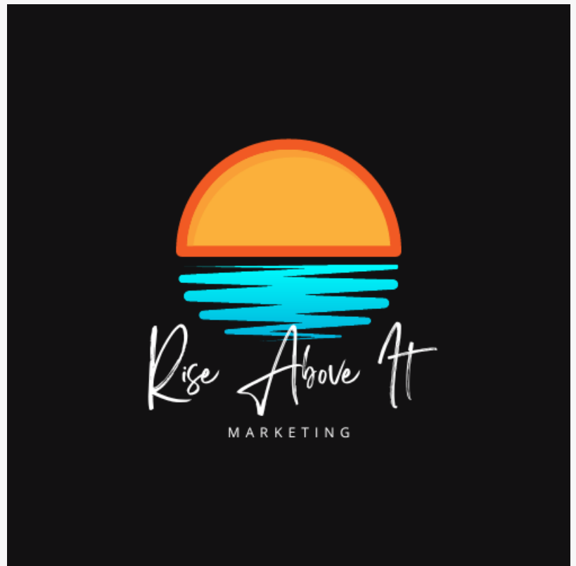
Rise Above It Marketing Consulting Services

United States — Rise Above It Marketing, a woman-owned strategic marketing consultancy, has announced continued growth in 2025 as it expands its role as a trusted resource for businesses in the home services, interior design, franchising, and home improvement industries. Known for delivering strategy-first solutions, the agency helps companies streamline marketing operations, strengthen brand positioning, and generate qualified leads.